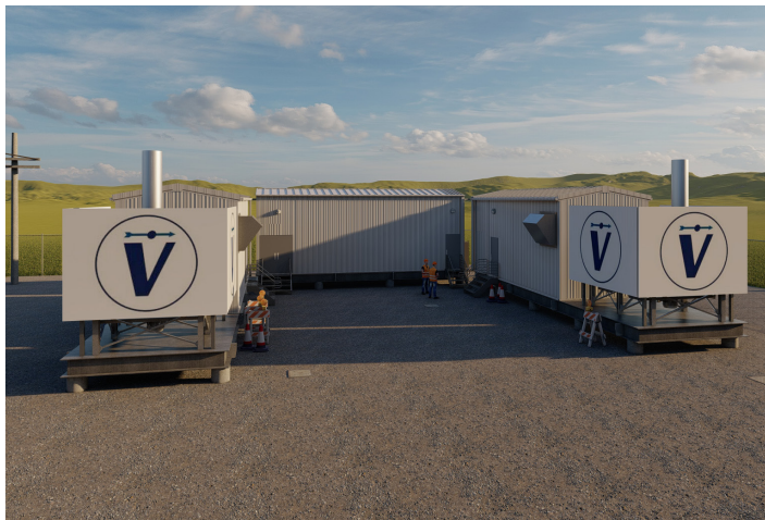
Rendering of the proposed project footprint.