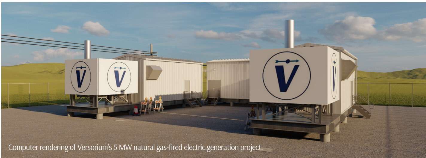
Computer rendering of Versorium's 5 MW natural gas-fired electric generation project.

Scott Builders Inc. (SBI) is responsible for completing civil engineering work, procurement of sub-contractors and services, and installation and construction of the Project. SBI specializes in projects that are unique or outside the traditional scope of a construction project, such as Versorium's projects, and offers complete project delivery services for the industrial market. SBI was chosen for their design and build experience in the industrial market in Alberta and their commitment to safety.