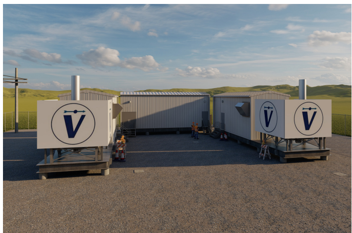
Rendering of the proposed project's components.